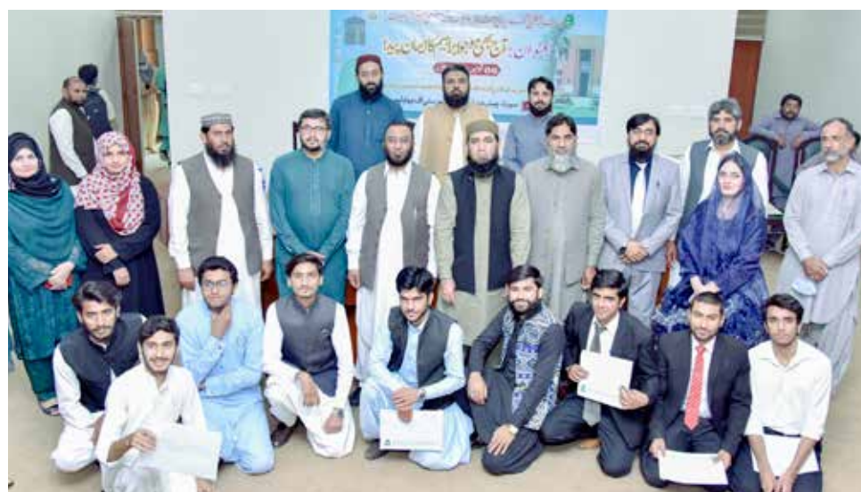
Seminar participants along with Dean Faculty of Islamic Learning