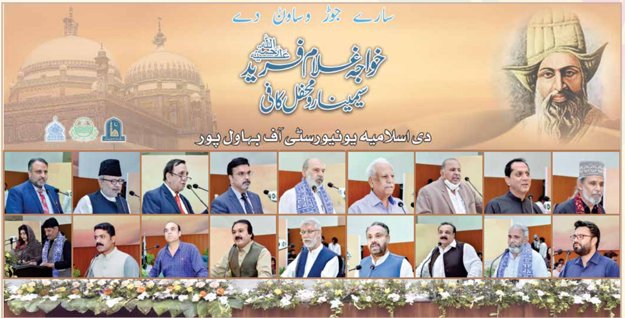
Khawaja Ghulam Farid (RA) Seminar and Mehfil-e-Kaafi | 17