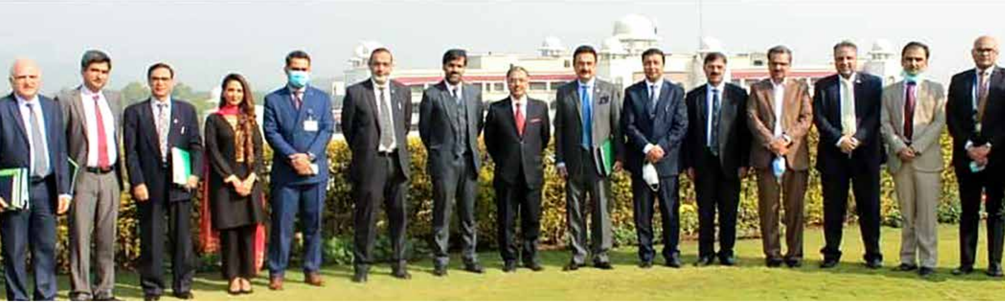
A group photo of participants of Consortium of Excellence COMSTech and MoFA

our efforts to achieve excellence in partnership. He said that Pakistan has done a lot in the area of Science and Technology and now it's time to reap the benefit by showcasing Pakistan. He said that this forum would bring technology to Pakistan and would help in internationalization of the areas of Science, Technology, Engineering and Mathematics. The COMSTech - MoFA collaboration will open new