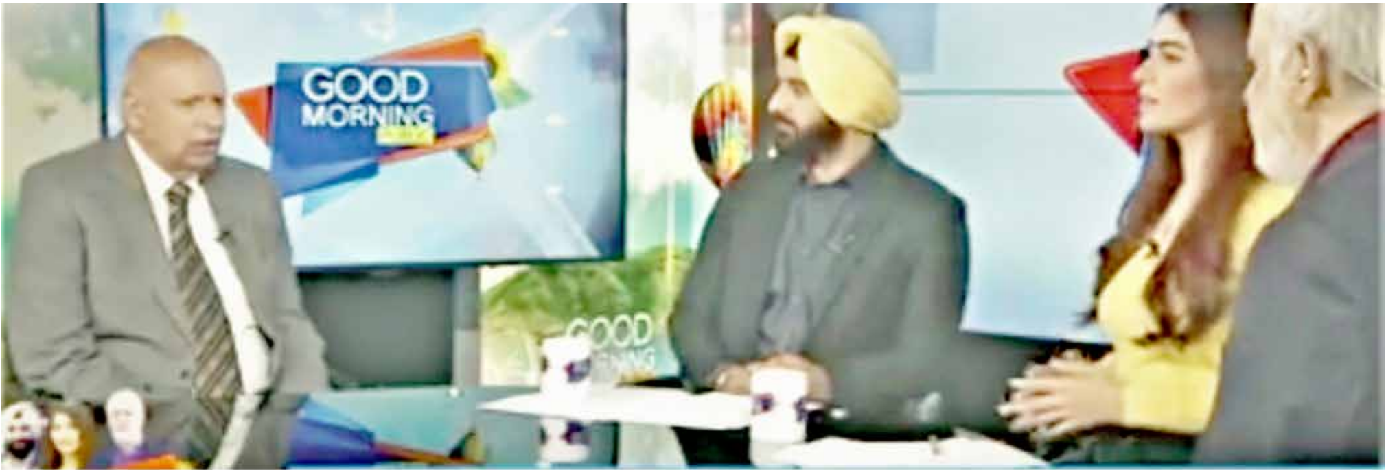
Governor Punjab Chaudhary Muhammad Sarwar exchanging views in a Morning Show

Islamia University Bahawalpur in various forums even during Covid-19. He also appreciated the donation of more than Rs. 7 million in Corona Relief Funds by the University employees during Covid-19. He had commended the research activities of teachers and students, preparation of hand sanitizers, ventilators, plasma app for COVID patients, online educational activities and conducting of online examinations.