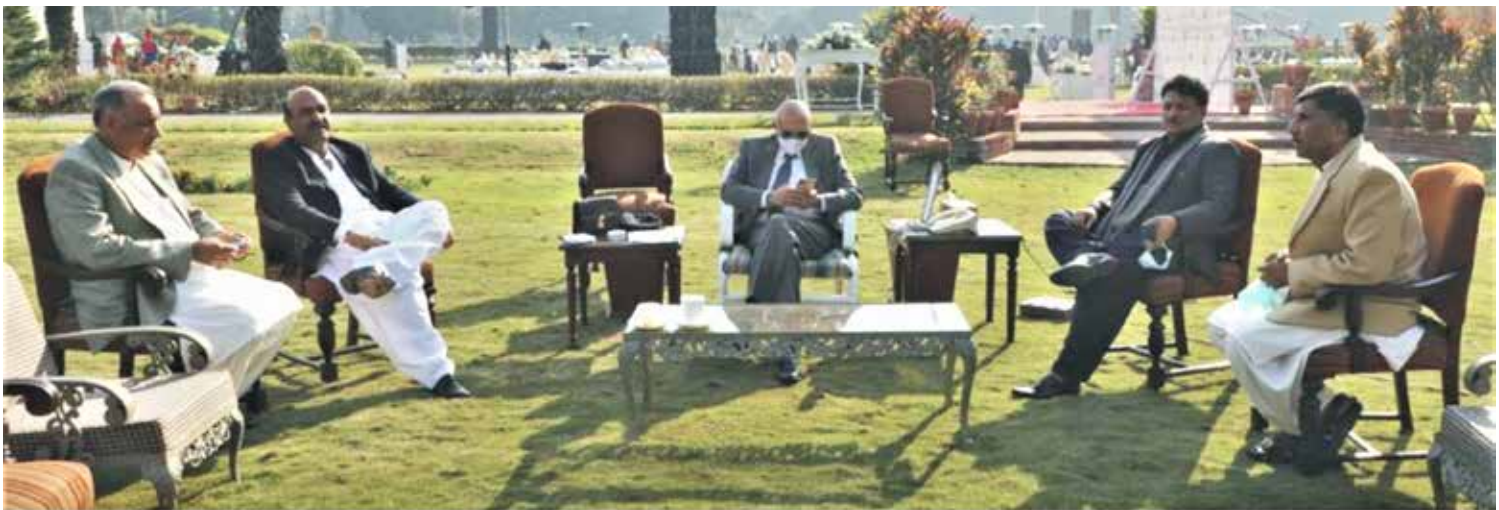
Governor Punjab, Chaudhary Muhammad Sarwar presided over the Farmers’ Day celebrations at Governor’s House Lahore