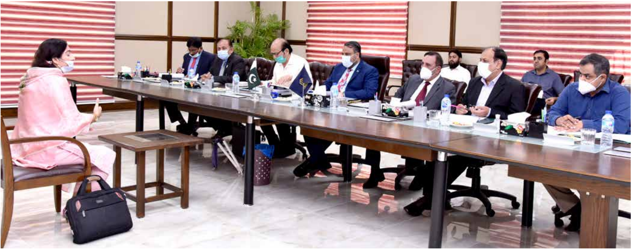
A view of selection board meeting