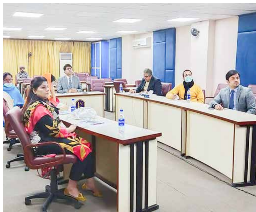
A view of Webinar on Role of E-Governance in Effective Public Service Delivery