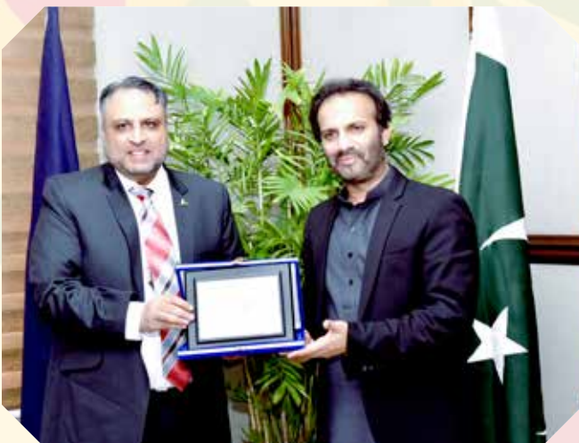
MD Pakistan Bait ul Mal Visits IUB | 03