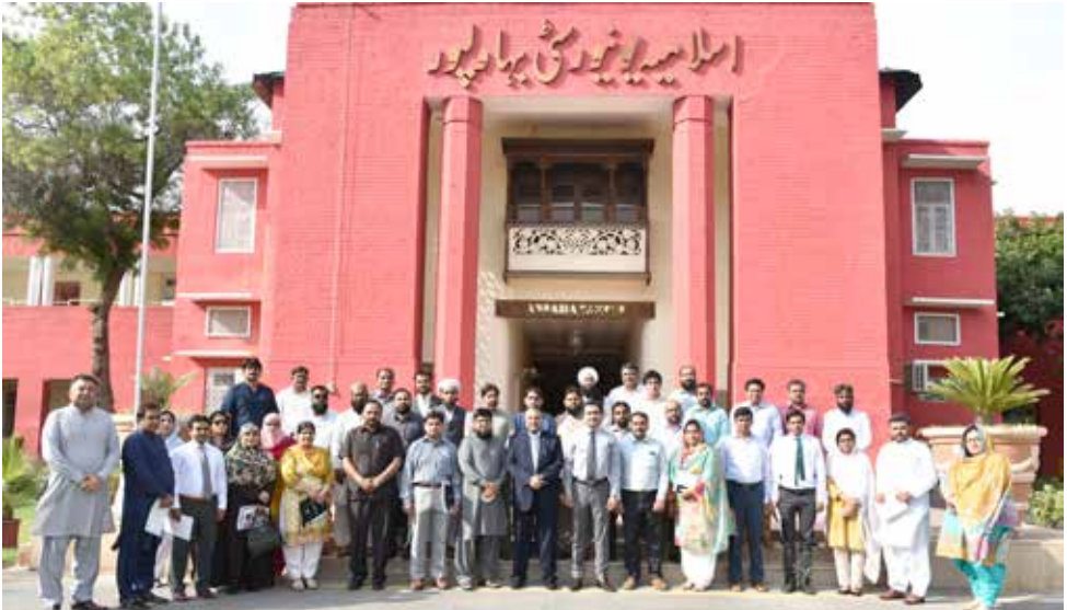
Participant of the training session on blended learning