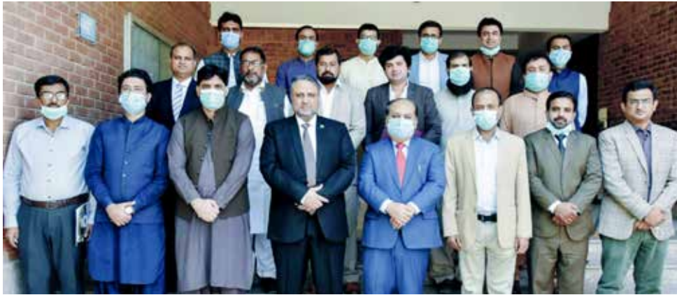
Group photo of IUB delegation with IBA Sukkur administration