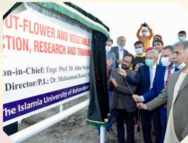
Inaugural Ceremony of the Project Cut-Flower and Vegetable Production Research and Training Cell | 13