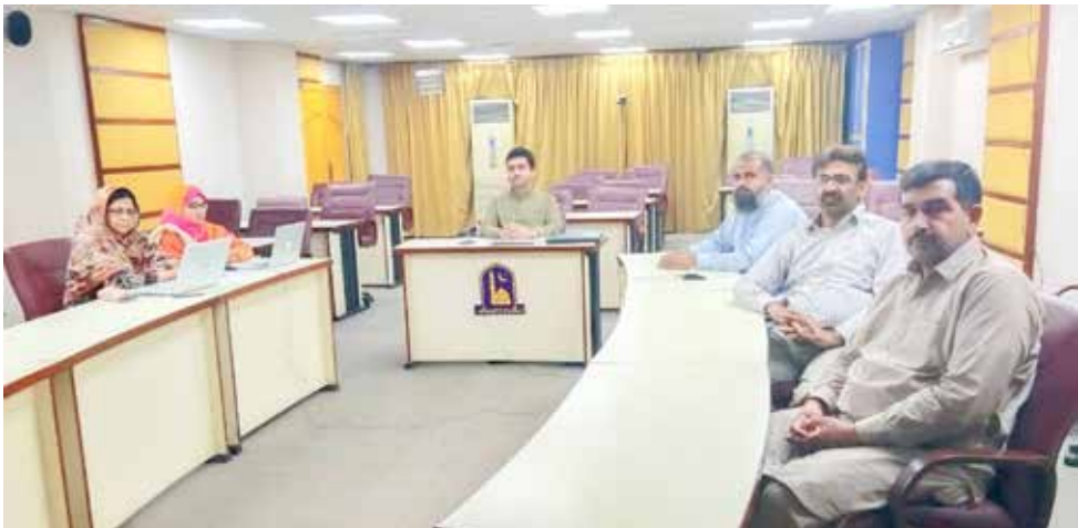
A view of webinar on Women in Physics