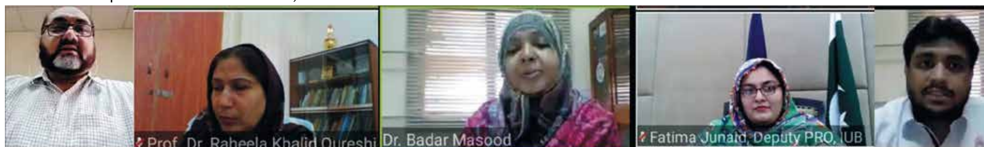
A view of webinar on Breast Cancer

in Pakistan this treatable disease is usually detected at advanced stage when nothing can turn the course of disease. We cannot rely or wait for others to take up this issue seriously and hoped that students will join to educate women on how they can reduce their risk of developing breast cancer.