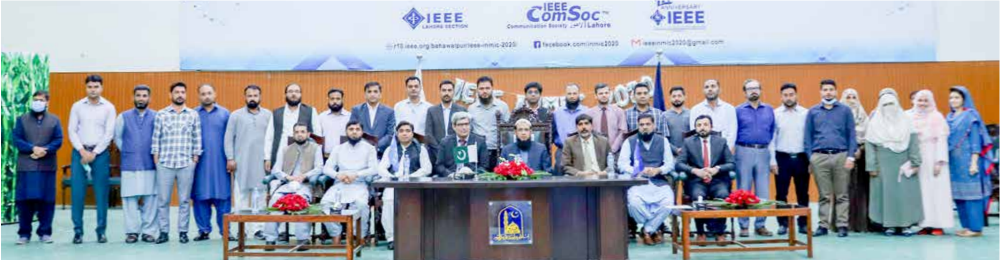
Participants of 2020 IEEE International Multi Topic Conference

on Renewable Energy, Image Processing, Intelligent Systems & Applications, and Machine Learning tracks were conducted at the IEEE Video Conference Room at New Engineering College Building. In the sessions, 56 papers were presented in total. Engr. Prof. Dr.