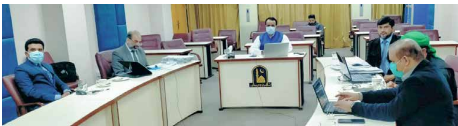
A view of online session on associate degree programme