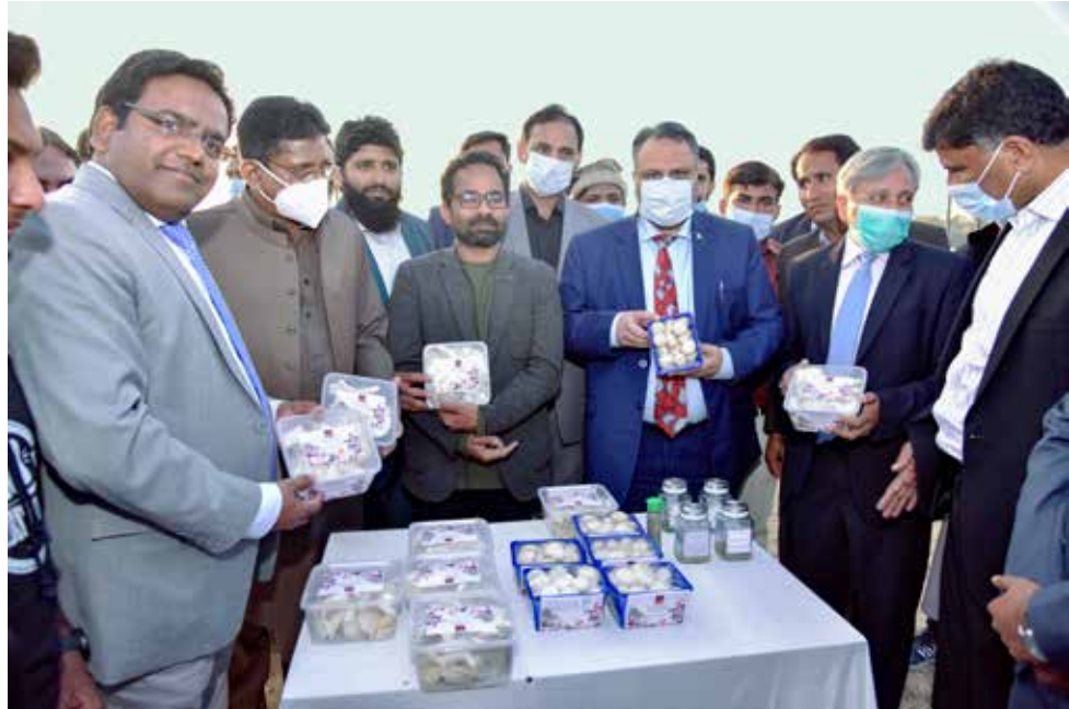
Tree Plantation and display of Mashroom products