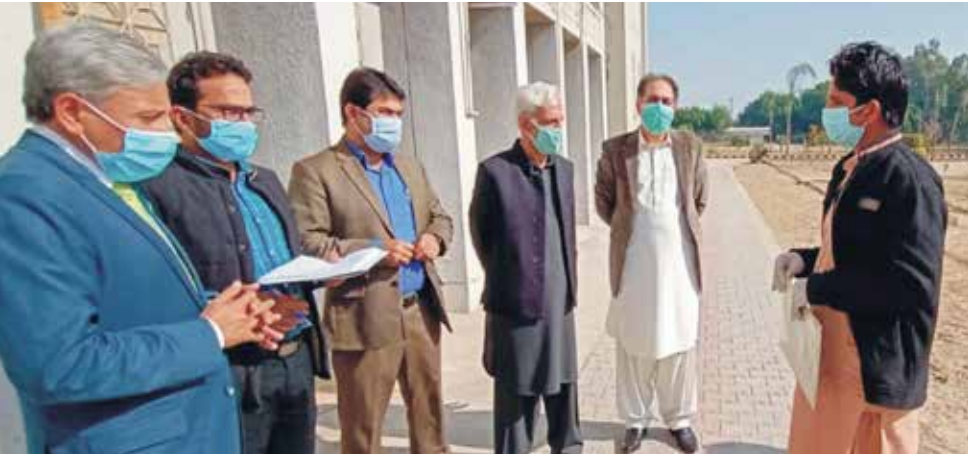
Selection Committee visited the Research and Training Cell of Cut Flowers and Vegetables Production