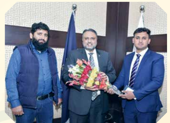
Punjab Information Technology Board Praises IUB E-Rozgar Center | 07