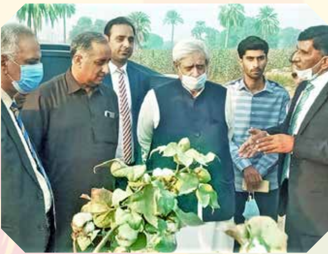
Federal Minister for National Food Security Visits IUB Agriculture Farm | 04