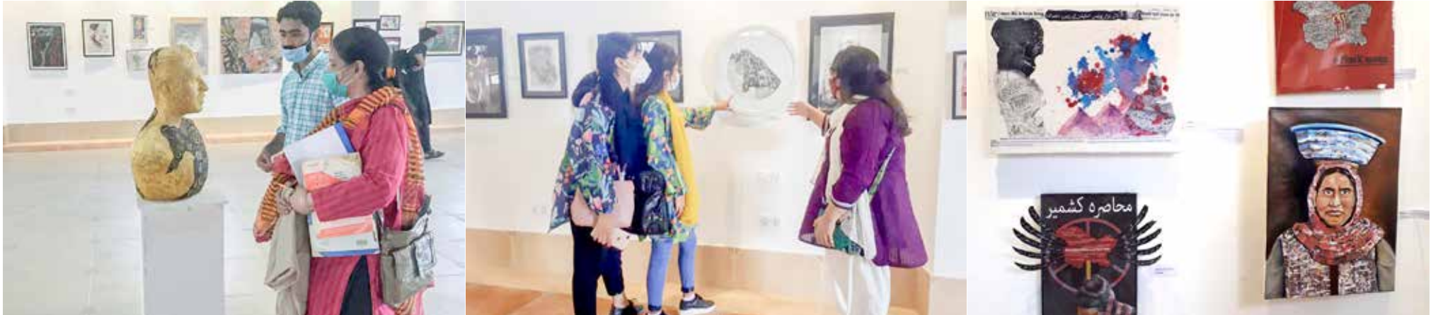
Art display highlighting Kashmir conflict at Hakra Art Gallery

violation of human rights in the valley. The artists in impressive manner displayed struggle and sacrifice of Kashmiri people through various mediums of art including painting, sculpture, calligraphy and miniature.