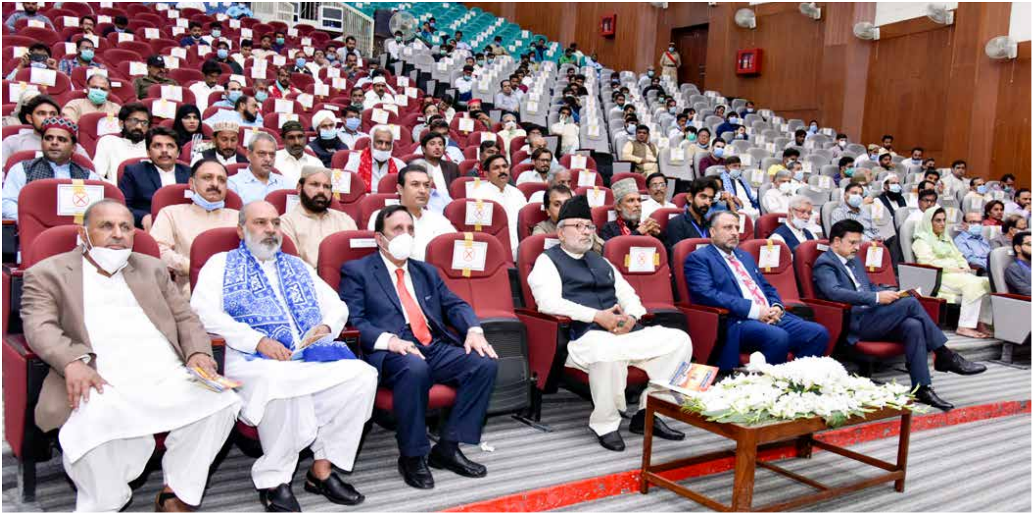
A view of audience in the Main auditorium