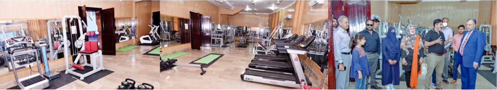
Opening of a gym at Sports Complex