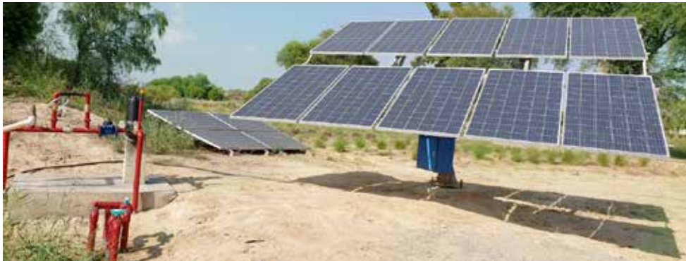
A view of solar system supported modern irrigation techniques