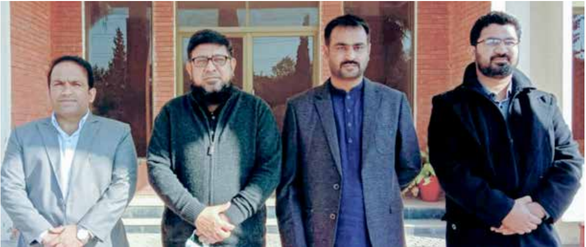
Faculty members of the Islamia University of Bahawalpur participated in training workshop at Akhtar Hameed Khan National Centre for Rural Development, Islamabad