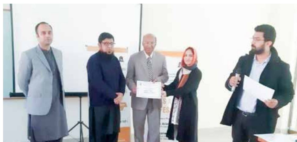
Certificate distribution among trainee associate lecturers