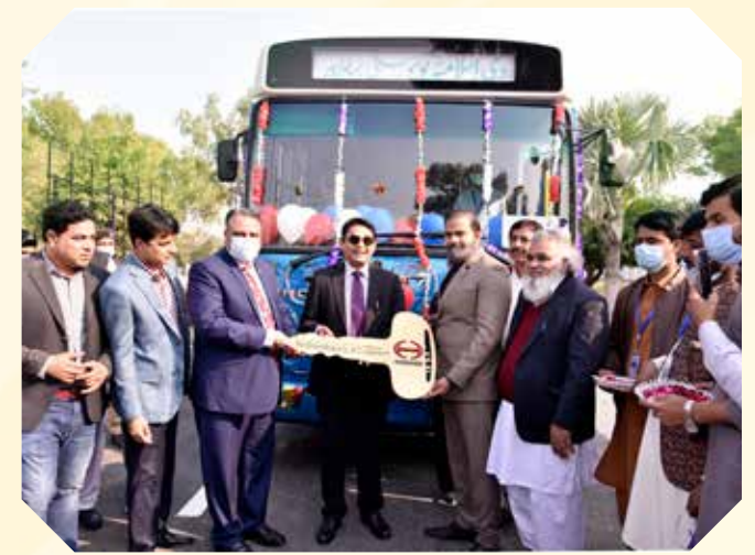
Commissioner Bahawalpur Inaugurates 4 New Buses | 09