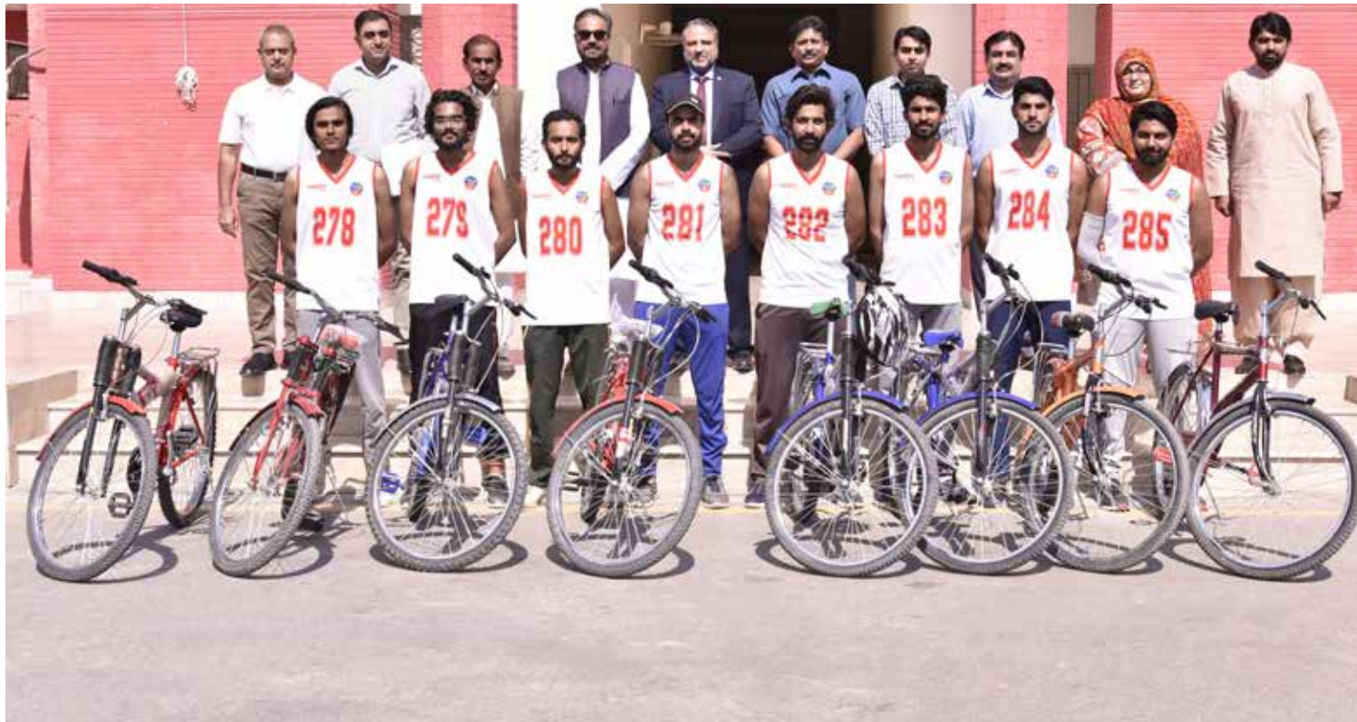
Group photo of Triathlon Team