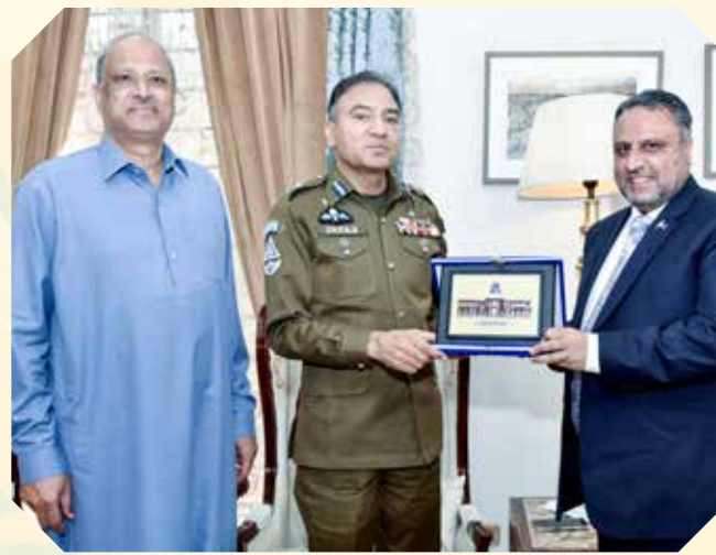
Additional IG Police South Punjab Visits IUB | 04