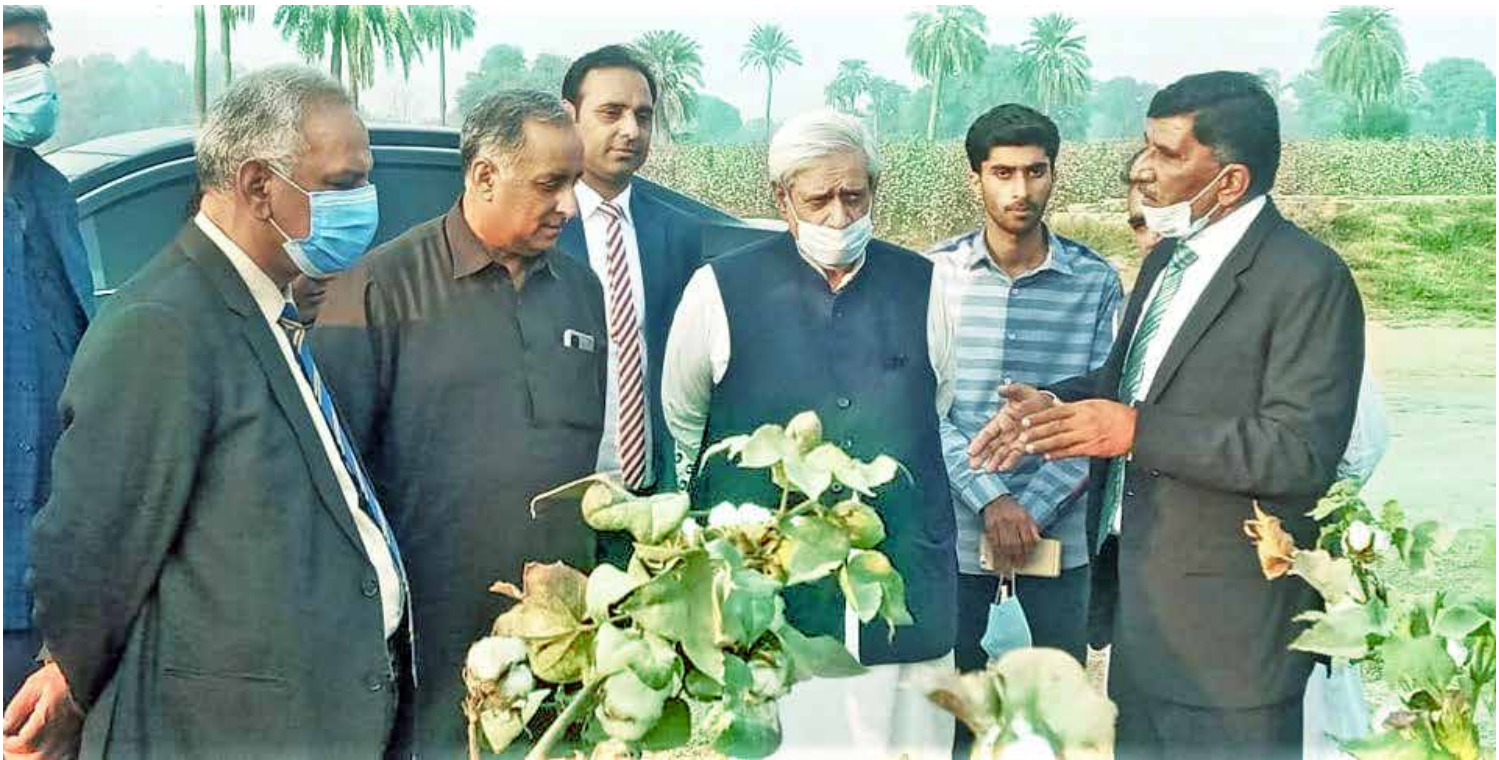
Syed Fakhar Imam, Federal Minister for National Food Security and Research is visiting IUB cotton field