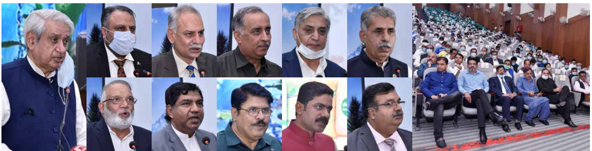
Federal Minister for Food Security and Research Syed Fakhar Imam and other speakers addressing the Farmer's Convention